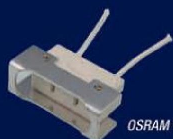
OSRAM PAR-1 socket

Unlike ordinary PAR lamps, the reflector in OSRAM aluPAR 64 lamps is made of aluminum, not aluminized glass. This makes aluPAR lamps up to 50% lighter in weight. Lighter means easier handling—and lower shipping and transportation costs. aluPAR is also one of our ECOLOGIC® environmentally preferable products. For a complete system solution use the OSRAM PAR-1 socket. For more aluPAR advantages, visit www.sylvania.com or call in the U.S. 888-677-2627.