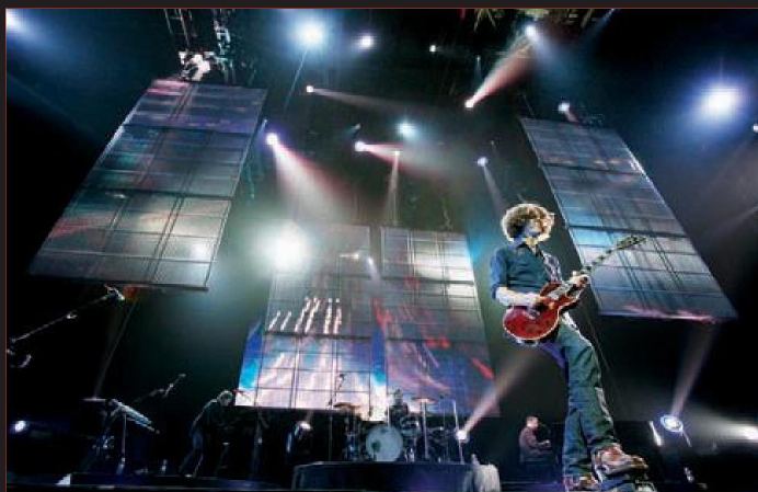
A VIRTUAL VIRTUOSO